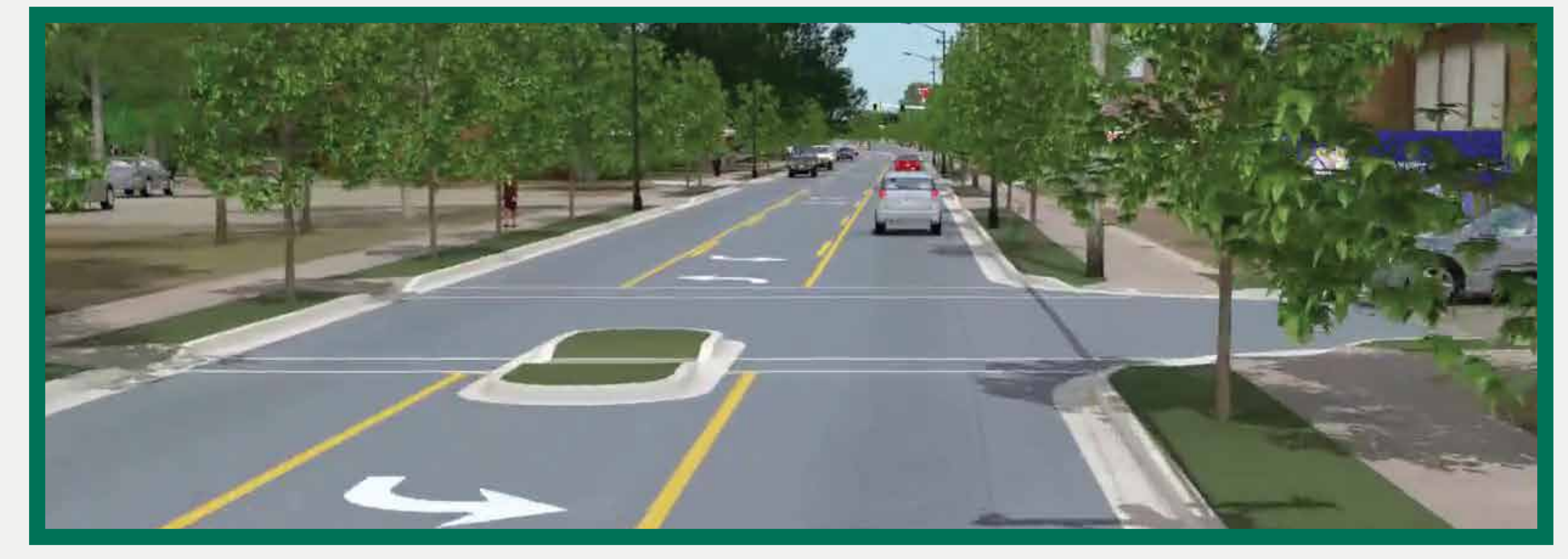
Location: near Portage St.

Patch St. to Ellis St. & College Ave. to Fourth Ave. 2-lane with Two-Way-Left-Turn-Lane