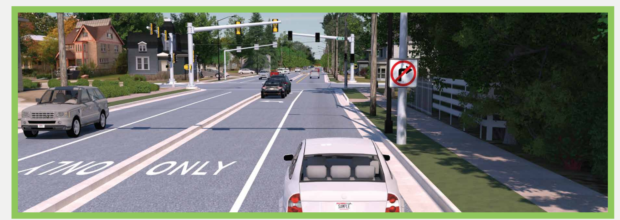
Location: between Clark and Main streets

Ellis St. to College Ave. 2-lane with Raised Median