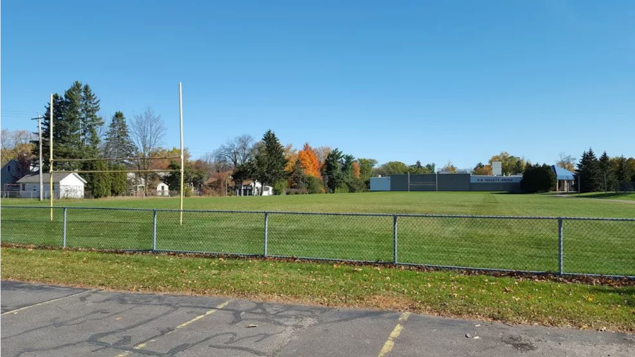
Home Field K.B. Willett Field